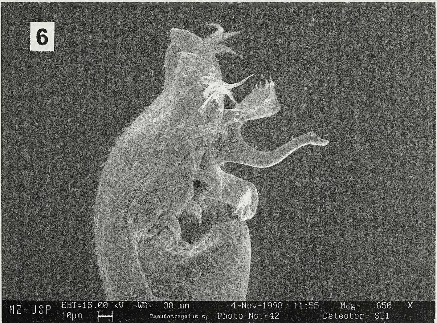
Figures 5–6.— Pseudotrogulus funebris new species, penis: 5. Dorsal; 6. Lateral.